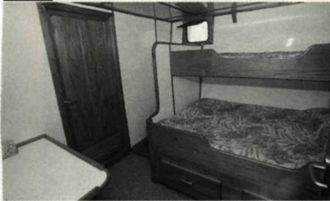
Above: The Sere 's guests reside in simple elegance in four ensuite staterooms; a fifth ensuite stateroom (not shown) provides a double bed and large windows.

Air Pacific Qantas (800) 227-4446 (800) 227-4500